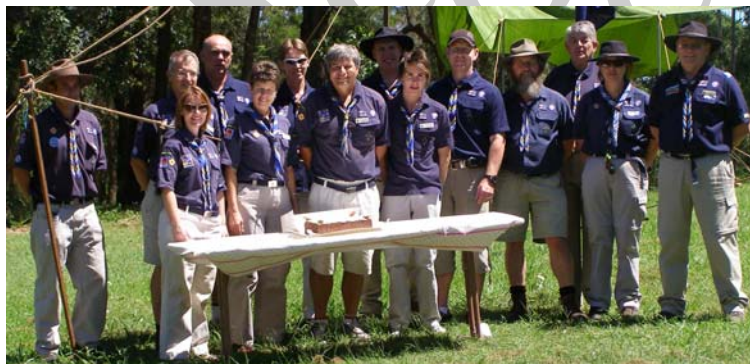
The Leadership Team at Winston Hills, 2008.